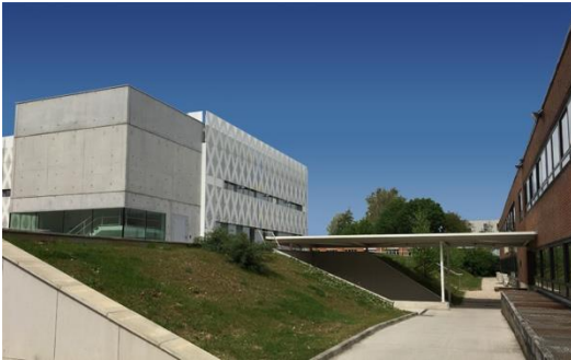
SPQI – 4BioDx

The SPQI society is located on the site of the CHU of Lille (France). You will find here ways to find our company building from the subway, by car, by train or by plane.