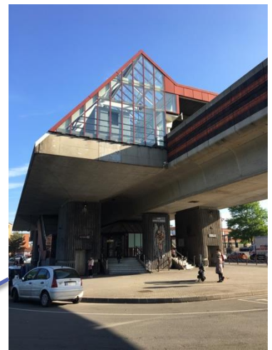
A : Subway station « CHU Centre Oscar Lambret »