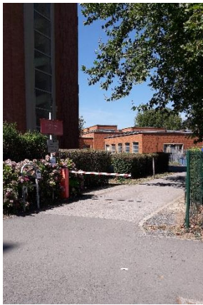
D : Parking entrance of research building