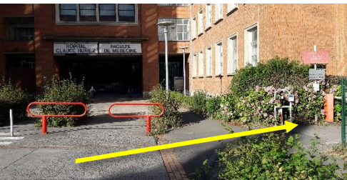
C : Entrance of Huriez Hospital