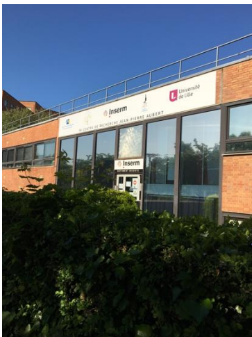
B : Inserm, Centre de Recherche Jean-Pierre Aubert