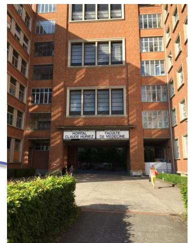
C : Entrance of Huriez hospital