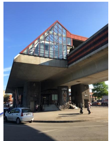
A : Subway station « CHU Centre Oscar Lambret »